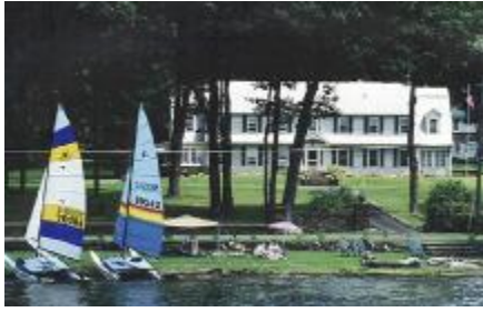
Chautauqua Lake's Only Lakefront Inn